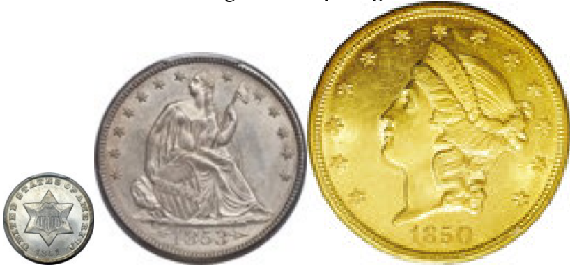
Obverse of 1851 “Trime,” 1853 with Arrows Half Dollar, and 1850 Double Eagle

mint opened in San Francisco, to help strike the precious metal into official coin without the dangerous sea passage.