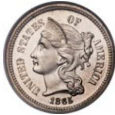
Obverse of Three Cent Nickel of 1865

from copper-nickel to bronze and enforcing the prohibition against the issuance of private Civil War Tokens. That same year, the Philadelphia Mint introduced a new coin denomination, the two-cent piece. This coin was made of the same bronze alloy as the new bronze cent, and it weighed exactly twice as much as a cent. The two-cent piece was the first U.S. coin to include the motto “In God We Trust.” The motto reflected the strong religious feeling that should the Union dissolve, and antiquarians look back on the short-lived “Liberty” series of coins from the former United States, it would be obvious why they were no more. Coins of foreign lands typically do reference the Deity in some manner, “By the Grace of God” they rule. the Civil War was not going well for the Union in 1863 and inspired such soul searching.