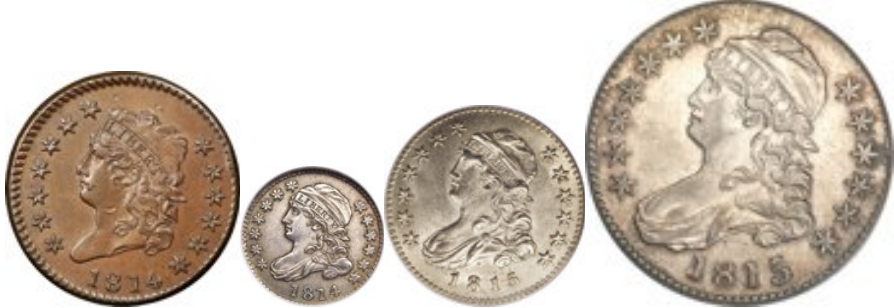
Obverse of Classic Head 1814 Cent, 1814 Bust Dime, 1815 Bust Quarter and 1815/2 Bust Half Dollar

on mintages dropped from 1,075,500 cents in 1812, to 418,000 cents in 1813, down to 357,830 in 1814. These coins were struck using a reserve of copper planchets the Philadelphia Mint received from Matthew Boulton’s factory in Birmingham, England, shortly before the War began. The Mint used the last of Boulton’s planchets on October 27, 1814, and struck no cents dated 1815 – the only date for which no cents were struck. Fresh planchets from Boulton arrived in late 1815, after the end of the War. Records indicate the Philadelphia Mint struck 465,500 cents in December 1815, probably using left-over 1814-dated dies to strike these coins: 1814 cents are relatively common, as would be expected if cents struck in December 1815 were dated 1814, whereas the newly designed, Matron-Head, 1816 cents are scarcer than would be expected had the Mint “jumped the gun” and begun striking 1816 cents in December 1815.