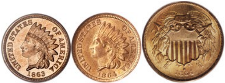
Obverse of 1863 Copper-Nickel Cent, 1864 Bronze Cent and Two Cent Piece of 1864

It is often said that “Truth is the first casualty of war,” but specie is the next casualty after Truth. The uncertainties of conflict lead people to hoard hard money – coins – as they await the outcome of unsettled times. Exigencies of the Civil War (April 12, 1861 –May 9, 1865) did not allow Confederate coinage to enter commerce, instead the Confederacy issued a flood of promissory banknotes, payable after victory, because the Confederacy had a small and diminishing treasury of foreign coins and older issue U.S. coins needing to be paid out overseas for military goods. They never developed a meaningful “national” precious metal coinage system. In both the Union and the Confederacy, gold and silver U.S. coins largely disappeared from circulation at the start of the War; by 1862, even the one cent coin was hard to find, though the Philadelphia Mint was pouring out cents in the tens of millions.