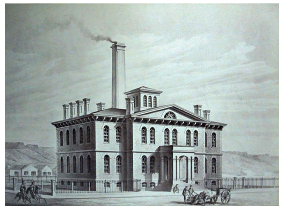
Carson City Mint

Congress authorized a new branch mint out West in 1863, to serve the largest silver strike in North American history, the Comstock Lode discovered in 1859. Thev sought to alleviate the need to transport tons of precious metal ore with no direct route from the Lake Tahoe region, across 172 statute miles, past 7000 feet tall Rocky Mountain peaks, through bandit territory, all the way to the Pacific coast for processing at the San Francisco Mint. Groundbreaking ceremonies at Carson City took place in September 1866, just eight years after the town was founded, five years after the formation of the Nevada Territory, and two years after Nevada statehood. A six-ton, Morgan & Orr steam-powered coin press (Coin Press #1) from Philadelphia arrived at Carson City in 1868. The construction of a Renaissance-revival sandstone mint building was completed in December 1869. The Carson City Mint opened for business under President Ulysses Grant in January 1870, and struck its first coin, a Seated Liberty Dollar with the new "CC" mint mark in February 1870. The Virginia & Truckee Railroad connected Carson City with the Transcontinental railroad at Reno in 1872 and by 1874, thirty-six trains a day were passing through Carson City during the peak production of the Comstock Mines.