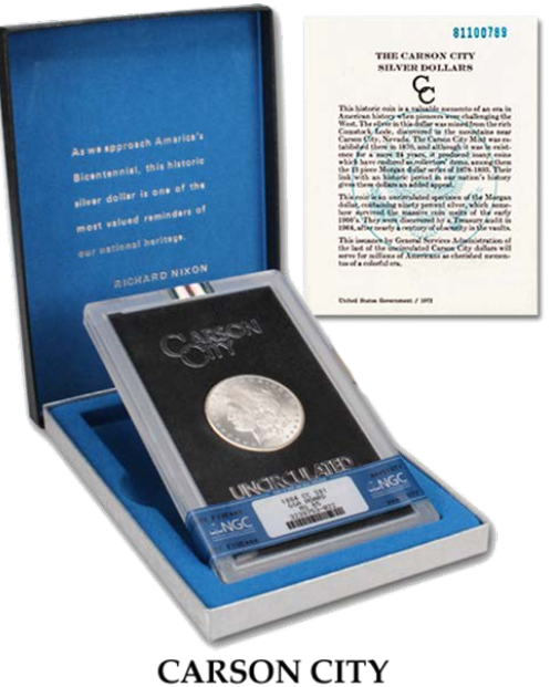
GSA MORGAN DOLLARS